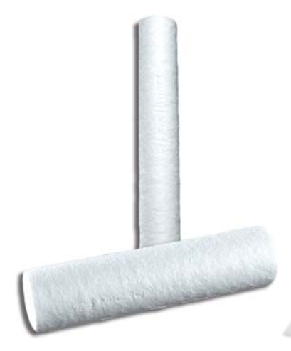
Figure 1: Purtrex Depth Cartridge Filters